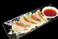
自家製煎 薩摩和牛餃子 (4隻) Homemade Wagyu Gyoza (4pcs) $48