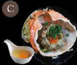
C1. 甲羅燒 Kanimiso Level 1: 1隻 pcs Level 2: 1隻 pcs Level 3: 1隻 pcs