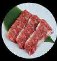
B2. 牛肋肉 Kalbi Level 1: 2片 pcs Level 2: 2片 pcs Level 3: 3片 pcs