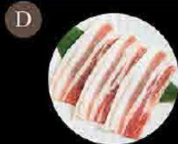
D1. 霧島黑豚腩肉 Kirishima Kurobuta Belly Level 1: 2片 pcs Level 2: 2片 pcs Level 3: 3片 pcs