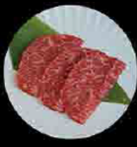
B3. 牛赤肉 Lean Level 1: 2片 pcs Level 2: 2片 pcs Level 3: 3片 pcs