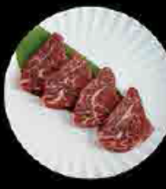
C3. 樂天澳洲和牛封門柳 Australian Hanging Tender Level 1: 3片 pcs Level 2: 3片 pcs Level 3: 4片 pcs