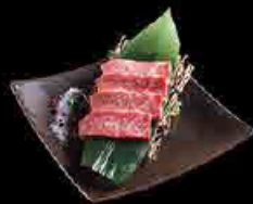
牛肋肉 (2片) Kalbi (2pcs) $38