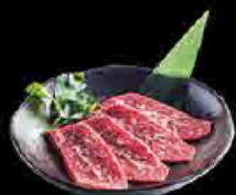
Yaki-Shabu 上等牛赤肉 (1片) Top Lean Yaki Shabu (1 pcs) $28