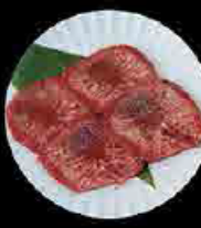
C2. 上等牛舌 Top Ox Tongue (US) Level 1: 3片 pcs Level 2: 3片 pcs Level 3: 4片 pcs