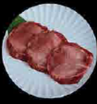
A3. 極上牛舌 Finest Ox Tongue Level 1: 2片 pcs Level 2: 2片 pcs Level 3: 3片 pcs