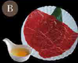
B1. Yaki-Shabu 上等牛赤肉 Top Lean Yaki Shabu Level 1: 2片 pcs Level 2: 2片 pcs Level 3: 3片 pcs