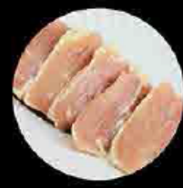
D2. 雞腿肉 Chicken Thigh Level 1: 3片 pcs Level 2: 3片 pcs Level 3: 5片 pcs