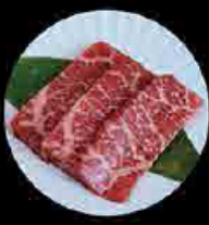
A2. 上等牛赤肉 Top Lean Level 1: 2片 pcs Level 2: 2片 pcs Level 3: 3片 pcs