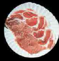
D3. 霧島黑豚梅肉薄燒 Kirishima Kurobuta Collar Level 1: 2片 pcs Level 2: 2片 pcs Level 3: 3片 pcs

所有燒肉午餐包括 all Yakiniku lunch served with: