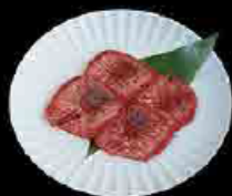
上等牛舌 (2片) Top Ox Tongue (US) (2pcs) $36