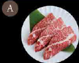
A1. 上等牛肋肉 Top Kalbi Level 1: 2片 pcs Level 2: 2片 pcs Level 3: 3片 pcs

$288 A-D種類 每種類1款 1 per category (件數增量Increment)