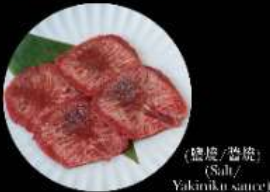
C2. 上等牛舌 Top Ox Tongue (US) Level 1: 3片 pcs Level 2: 3片 pcs Level 3: 4片 pcs