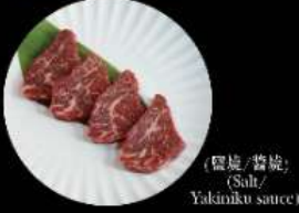
C4. 樂天澳洲和牛封門柳 Australian Hanging Tender Level 1: 3片 pcs Level 2: 3片 pcs Level 3: 4片 pcs