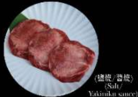
B2. 極上牛舌 Finest Ox Tongue Level 1: 2片 pcs Level 2: 2片 pcs Level 3: 3片 pcs