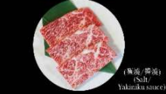
A4. 牛肩胛肉 Chuck Roll Level 2: 2片 pcs Level 3: 3片 pcs