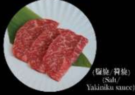
B4. 牛後腿肉 Gooseneck Round Level 1: 2片 pcs Level 2: 2片 pcs Level 3: 3片 pcs