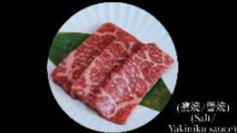
A2. 上等牛後腿肉 Top Gooseneck Round Level 2: 2片 pcs Level 3: 3片 pcs