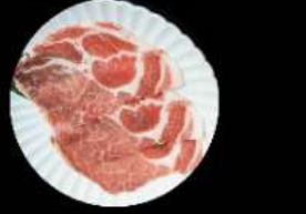
D4. 北海道黑豚豬梅肉薄燒 Hokkaido Kurobuta Collar Level 1: 2片 pcs Level 2: 2片 pcs Level 3: 3片 pcs

所有燒肉午餐包括 all Yakiniku lunch served with: 味噌湯 Miso Soup, 茶碗蒸 Chawanmushi, 精選前菜 Appetizer of the Day, 白飯 Rice, 咖啡或茶 (熱 / 凍) Coffee or Tea (Hot/Iced)