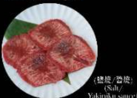
C2. 上等牛舌 Top Ox Tongue (US) Level 1: 3片 pcs Level 2: 3片 pcs Level 3: 4片 pcs