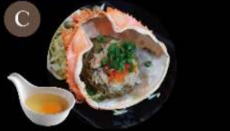
C1. 甲羅燒 Kanimiso Level 1: 1隻 pcs Level 2: 1隻 pcs Level 3: 1隻 pcs