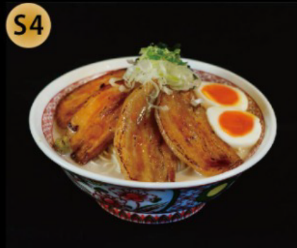
S4 火炙柚子北海道黑豚腩拉麵 Aburi Hokkaido Kurobuta Belly Soup Ramen