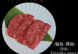
B4. 牛後腿肉 Gooseneck Round Level 1: 2片 pcs Level 2: 2片 pcs Level 3: 3片 pcs