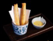
和牛芝士春卷(半份) Cheesy Wagyu Spring Roll (Half)