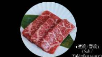
A2. 上等牛後腿肉 Top Gooseneck Round Level 2: 2片 pcs Level 3: 3片 pcs