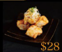
日式京蔥醬油炸雞(4件) Japanese-style Deep-fried Chicken with Scallion Soy Sauce (4pcs)