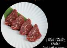
C4. 樂天澳洲和牛封門柳 Australian Hanging Tender Level 1: 3片 pcs Level 2: 3片 pcs Level 3: 4片 pcs