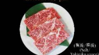
A4. 牛肩胛肉 Chuck Roll Level 2: 2片 pcs Level 3: 3片 pcs