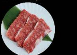
C3. 牛內裙邊 Inside Skirt Level 1: 2片 pcs Level 2: 2片 pcs Level 3: 3片 pcs