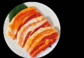
D2. 辣味北海道黑豚腩肉 (厚切) Spicy Kurobuta Kurobuta Belly (Thick Cut) Level 1: 2片 pcs Level 2: 2片 pcs Level 3: 3片 pcs