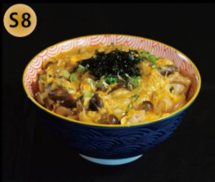
S8 親子丼 Oyakodon