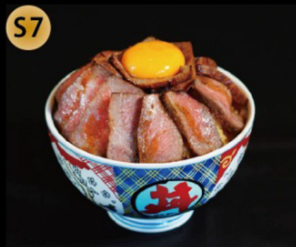
S7 月見薩摩上肩里脊肉井 Satsuma Zabuton Donburi