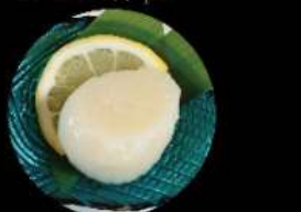
B3. 北海道刺身帶子 Hokkaido Scallop Level 1: 1件 pcs Level 2: 1件 pcs Level 3: 1件 pcs