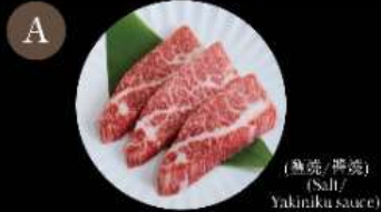
A1. 足日牛腹肉 Short Plate Level 2: 2片 pcs Level 3: 3片 pcs