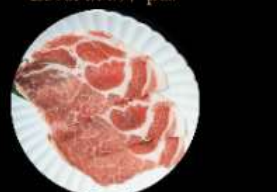
D4. 北海道黑豚豬梅肉薄燒 Hokkaido Kurobuta Collar Level 1: 2片 pcs Level 2: 2片 pcs Level 3: 3片 pcs

所有燒肉午餐包括 all Yakiniku lunch served with: 味噌湯 Miso Soup, 茶碗蒸 Chawanmushi, 精選前菜 Appetizer of the Day, 白飯 Rice, 咖啡或茶 (熱 / 凍) Coffee or Tea (Hot/Iced)