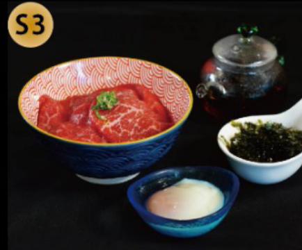
S3 薩摩和牛湯烏冬 Satsuma Gyu Soup Udon Bowl