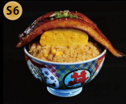
S6 蒲燒鰻魚配厚燒玉子井 Grilled Eels and Tamagoyaki Donburi