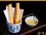
$28 Yaki-Shabu 上等牛舌 (2片) Top Ox Tongue (US) (2 pcs)