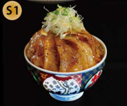
S1 醬燒北海道黑豚腩井 Yakiniku Hokkaido Kurobuta Belly Donburi

午市時段 Lunch Hours 星期一至五 Mon-Fri 11:30am-3:00pm