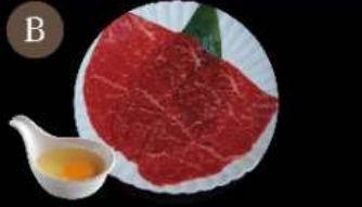
B1. Yaki-Shabu 上等牛後腿肉 (薄切) Top Gooseneck Round Yaki-Shabu Level 1: 2片 pcs Level 2: 2片 pcs Level 3: 3片 pcs