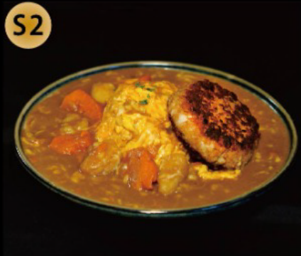
S2 日式咖哩芝士薩摩和牛漢堡扒定食 Satsuma Gyu Burger with Japanese Curry Cheese Sauce