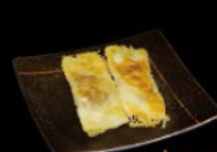
鐵板煎薩摩和牛餃子(半份) Pan Seared Homemade Gyoza (Half)