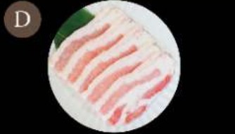
D1. 北海道黑豚腩肉 Spicy Kurobuta KurobutBelly Level 1: 3片 pcs Level 2: 3片 pcs Level 3: 5片 pcs