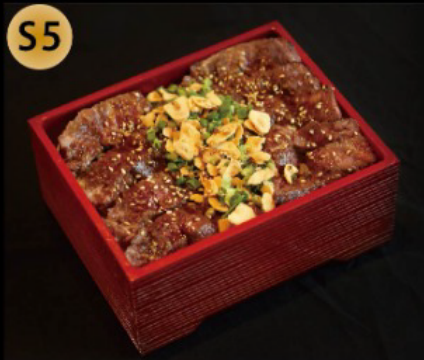
S5 蒜片香蔥樂天澳洲和牛 封門柳扒定食 Grilled Eels and Tamagoyaki Donburi