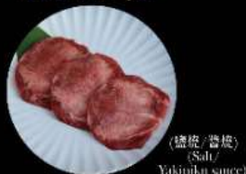
B2. 極上牛舌 Finest Ox Tongue Level 1: 2片 pcs Level 2: 2片 pcs Level 3: 3片 pcs