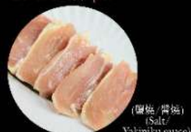
D3. 雞腿肉 Chicken Thigh Level 1: 3片 pcs Level 2: 3片 pcs Level 3: 5片 pcs