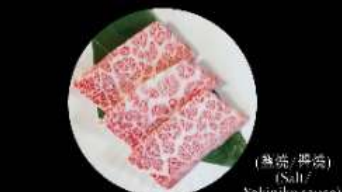
A3. 足日稀少部位 Rare Cut of the Day (Salt/Yakiniku sauce) Level 2: 2片 pcs Level 3: 3片 pcs