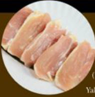
D2. 雞腿肉 Chicken Thigh Level 1: 3片 pcs Level 2: 3片 pcs Level 3: 5片 pcs