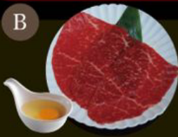
B1. Yaki-Shabu 上等牛後腿肉 (薄切) Top Gooseneck Round Yaki-Shabu Level 1: 2片 pcs Level 2: 2片 pcs Level 3: 3片 pcs