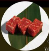
B2. 澳洲和牛西冷粒 AUS Wagyu Chuck Short Rib Level 1: 2片 pcs Level 2: 2片 pcs Level 3: 3片 pcs