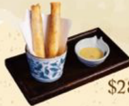
和牛芝士春卷 (半份) Cheesy Wagyu Spring Roll (Half)