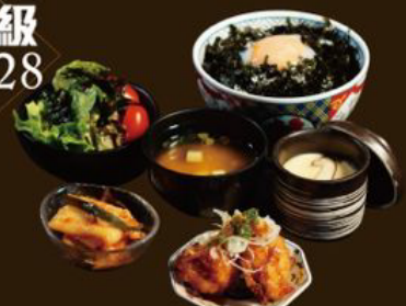
溫泉蛋韓式紫菜飯 Rice with Onsen Egg and Roasted Seaweed 增量沙律 Mini Salad (upgrade), 日式京蔥油炸雞 Deep-fried Chicken with Scallion and Minced Ginger 2pcs