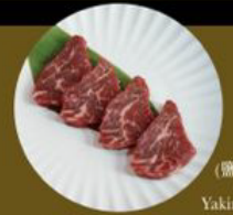
C4. 樂天澳洲和牛封門柳 Australian Hanging Tender Level 1: 2片 pcs Level 2: 2片 pcs Level 3: 3片 pcs