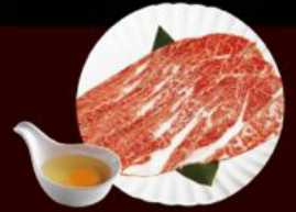
A4. Yaki-Shabu 牛肩肉 (薄切) Sliced Chuck Roll Yaki-Shabu Level 2: 2片 pcs Level 3: 3片 pcs