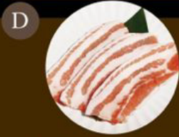
D1. 北海道黑豚腩肉片 Hokkaido Kurobuta Belly Level 1: 2片 pcs Level 2: 2片 pcs Level 3: 3片 pcs