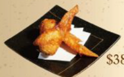
明太子雞翼 (2件) Stuffed Chicken Wing with Mentaiko (2pcs)