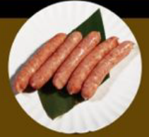
D4. 甘熟豚肉腸 Nangoku Sweet Pork Sausage Level 1: 3件 pcs Level 2: 3件 pcs Level 3: 5件 pcs

所有燒肉午餐包括 all Yakiniku lunch served with: 味噌湯 Miso Soup, 茶碗蒸 Chawanmushi, 精選前菜 Appetizer of the Day, 沙律 Mini Salad, 白飯 Rice, 咖啡或茶 (熱 / 凍) Coffee or Tea (Hot/Iced)