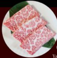
A3. 是日稀少部位 Rare Cut of the Day (Salt/Yakiniku sauce) Level 2: 2片 pcs Level 3: 3片 pcs