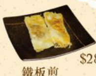
鐵板煎 薩摩和牛餃子 (半份) Pan Seared Homemade Gyoza (Half)