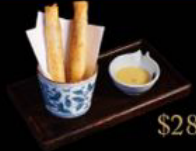
和牛芝士春卷 (半份) Cheesy Wagyu Spring Roll (Half) $28