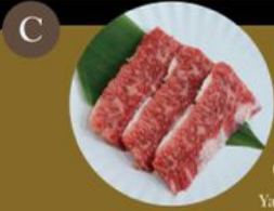
C1. 牛內裙邊 Inside Skirt Level 1: 2片 pcs Level 2: 2片 pcs Level 3: 3片 pcs