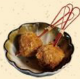
日式炸和牛肉丸 (2件) Deep-fried Wagyu Beef Ball (2pcs)