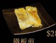
薩摩和牛餃子 (半份) Pan Seared Homemade Gyoza (Half) $28