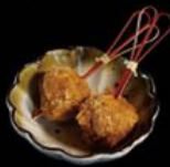
日式炸和牛肉丸 (2件) Deep-fried Wagyu Beef Ball (2pcs) 28