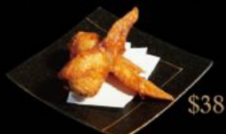
明太子雞翼 (2件) Stuffed Chicken Wing with Mentaiko $38