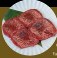
C3. 上等牛舌 Top Ox Tongue (US) Level 1: 3片 pcs Level 2: 3片 pcs Level 3: 4片 pcs