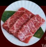
A2. 上等牛後腿肉 Top Gooseneck Round Level 2: 2片 pcs Level 3: 3片 pcs