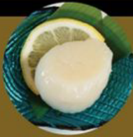
C2. 北海道刺身帶子 Hokkaido Scallop Level 1: 1件 pcs Level 2: 1件 pcs Level 3: 1件 pcs