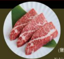
B4. 是日牛腹肉 Short Plate Level 1: 2片 pcs Level 2: 2片 pcs Level 3: 3片 pcs