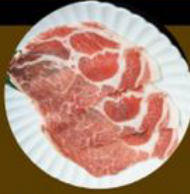
D3. 霧島黑豚豚肉薄燒 Kirishima Kurobuta Collar Level 1: 2片 pcs Level 2: 2片 pcs Level 3: 3片 pcs