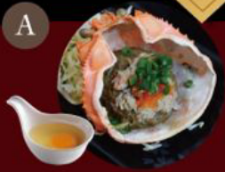
A1. 甲羅燒 Kanimiso Level 2: 1隻 pcs Level 3: 1隻 pcs

每種類1款/1 per category (件數增量Increment) $288