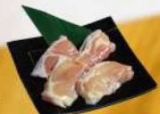
雞腿肉 (4片) Chicken Thigh (4pcs) $28