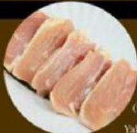
D2. 雞腿肉 Chicken Thigh Level 1: 3片 pcs Level 2: 3片 pcs Level 3: 5片 pcs