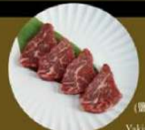
C4. 樂天澳洲和牛封門柳 Australian Hanging Tender Level 1: 2片 pcs Level 2: 2片 pcs Level 3: 3片 pcs