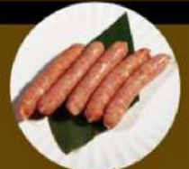
D4. 甘熟豚肉腸 Nangoku Sweet Pork Sausage Level 1: 3件 pcs Level 2: 3件 pcs Level 3: 5件 pcs

所有燒肉午餐包括 all Yakiniku lunch served with: 味噌湯 Miso Soup, 茶碗蒸 Chawanmushi, 精選前菜 Appetizer of the Day, 沙律 Mini Salad, 白飯Rice, 咖啡或茶 (熱/凍) Coffee or Tea (Hot/Iced)