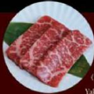
A2. 上等牛後腿肉 Top Gooseneck Round Level 2: 2片 pcs Level 3: 3片 pcs