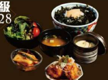
溫泉蛋韓式紫菜飯 Rice with Onsen Egg and Roasted Seaweed 增量沙律 Mini Salad (upgrade), 日式京蔥油炸雞 Deep-fried Chicken with Scallion and Minced Ginger 2pcs