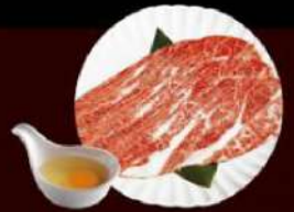
A4. Yaki-Shabu 牛肩肉 (薄切) Sliced Chuck Roll Yaki-Shabu Level 2: 2片 pcs Level 3: 3片 pcs