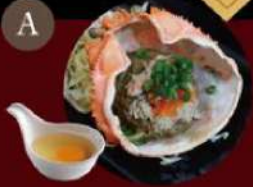
A1. 甲羅燒 Kanimiso Level 2: 1隻 pcs Level 3: 1隻 pcs