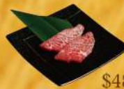
澳洲和牛 三角腩 (2片) AUS Wagyu Chuck Short Rib (2pcs) $48