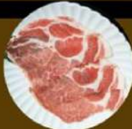
D3. 霧島黑豚豚肉薄燒 Kirishima Kurobuta Collar Level 1: 2片 pcs Level 2: 2片 pcs Level 3: 3片 pcs