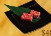
澳洲和牛 西冷扒粒 (2件) AUS Wagyu Sirloin Steak Cube (2pcs) $48

•圖片只供參考·加一服務費·以上優惠不可與其他優惠同時使用·如有任何爭議·Beefar's保留最終決定權·Photos are for reference only·10% Service Charge·This offer cannot be used in conjunction with other promotional offers. In case of disputes, the decision of Beefar's shall be final.