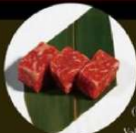
B2. 澳洲和牛西冷粒 AUS Wagyu Chuck Short Rib Level 1: 2片 pcs Level 2: 2片 pcs Level 3: 3片 pcs