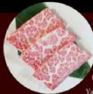
A3. 是日稀少部位 Rare Cut of the Day (Salt/Yaki- niku sauce) Level 2: 2片 pcs Level 3: 3片 pcs