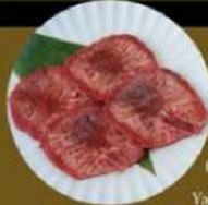
C3. 上等牛舌 Top Ox Tongue(US) Level 1: 3片 pcs Level 2: 3片 pcs Level 3: 4片 pcs