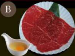
B1. Yaki-Shabu 上等牛後腿肉 (薄切) Top Gooseneck Round Yaki-Shabu Level 1: 2片 pcs Level 2: 2片 pcs Level 3: 3片 pcs