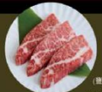
B4. 是日牛腹肉 Short Plate Level 1: 2片 pcs Level 2: 2片 pcs Level 3: 3片 pcs