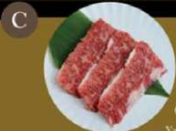
C1. 牛內裙邊 Inside Skirt Level 1: 2片 pcs Level 2: 2片 pcs Level 3: 3片 pcs