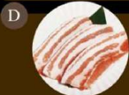
D1. 北海道黑豚腩肉片 Hokkaido Kurobuta Belly Level 1: 2片 pcs Level 2: 2片 pcs Level 2: 3片 pcs