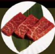
B3. 澳洲和牛三角腩 AUS Wagyu Sirloin Level 1: 2片 pcs Level 2: 2片 pcs Level 3: 3片 pcs