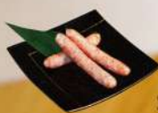
甘熟豚肉腸 (3件) Nangoku Sweet Pork Sausage (3pcs) $28

•精選前菜 Appetiser of the Day •沙律 Mini Salad •麵豉湯 Miso Soup •白飯 Rice •咖啡或茶 (熱/凍) Coffee or Tea (Hot/Iced)