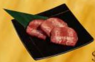
上等牛舌 (3片) Top Ox Tongue (US) (3pcs) $38