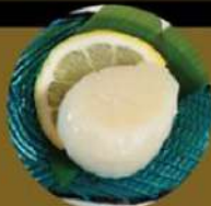
C2. 北海道刺身帶子 Hokkaido Scallop Level 1: 1件 pcs Level 2: 1件 pcs Level 3: 1件 pcs