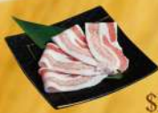
北海道 黑豚腩肉 (4片) Hokkaido Kurobuta Belly (4pcs) $28