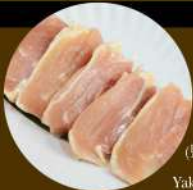
D2. 雞腿肉 Chicken Thigh Level 1: 3片 pcs Level 2: 3片 pcs Level 3: 5片 pcs