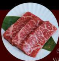
A2. 上等牛後腿肉 Top Gooseneck Round Level 2: 2片 pcs Level 3: 3片 pcs