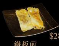
鐵板煎 薩摩和牛餃子 (半份) Pan Seared Homemade Gyoza (Half)