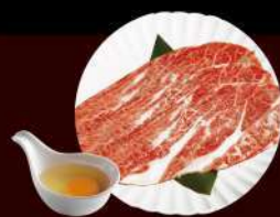
A4. Yaki-Shabu 牛肩肉 (薄切) Sliced Chuck Roll Yaki-Shabu Level 2: 2片 pcs Level 3: 3片 pcs