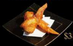
明太子雞翼 (2件) Stuffed Chicken Wing with Mentaiko