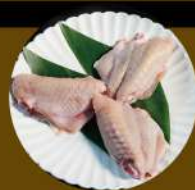
D4. 雞中翼 Nangoku Chicken Wing Level 1: 2件 pcs Level 2: 2件 pcs Level 3: 3件 pcs

所有燒肉午餐包括 all Yakiniku lunch served with: 味噌湯 Miso Soup, 茶碗蒸 Chawanmushi, 精選前菜 Appetizer of the Day, 沙律 Mini Salad, 白飯 Rice, 咖啡或茶 (熱/凍) Coffee or Tea (Hot/Iced)