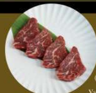
C4. 樂天澳洲和牛封門柳 Australian Hanging Tender Level 1: 2片 pcs Level 2: 2片 pcs Level 3: 3片 pcs