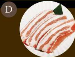
D1. 北海道黑豚腩肉片 Hokkaido Kurobuta Belly Level 1: 2片 pcs Level 2: 2片 pcs Level 2: 3片 pcs