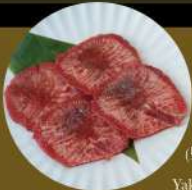
C3. 上等牛舌 Top Ox Tongue (US) Level 1: 3片 pcs Level 2: 3片 pcs Level 3: 4片 pcs