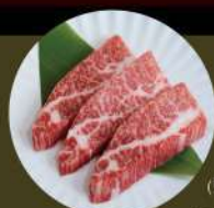
B4. 是日牛腹肉 Short Plate Level 1: 2片 pcs Level 2: 2片 pcs Level 3: 3片 pcs