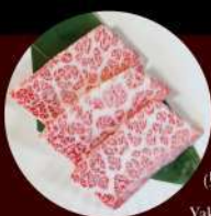
A3. 是日稀少部位 Rare Cut of the Day (Salt/Yakiniku sauce) Level 2: 2片 pcs Level 3: 3片 pcs