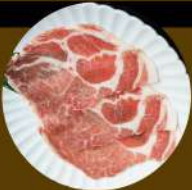
D3. 霧島黑豚梅肉薄燒 Kirishima Kurobuta Collar Level 1: 2片 pcs Level 2: 2片 pcs Level 3: 3片 pcs