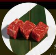
B2. 澳洲和牛西冷粒 AUS Wagyu Sirloin Level 1: 2片 pcs Level 2: 2片 pcs Level 3: 3片 pcs