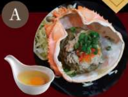
A1. 甲羅燒 Kanimiso Level 2: 1隻 pcs Level 3: 1隻 pcs

每種類1款/1 per category (件數增量Increment) $288