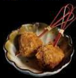
日式炸和牛肉丸 (2件) Deep-fried Wagyu Beef Ball (2pcs)