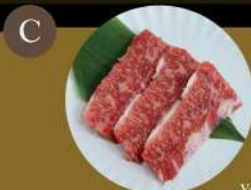
C1. 牛內裙邊 Inside Skirt Level 1: 2片 pcs Level 2: 2片 pcs Level 3: 3片 pcs