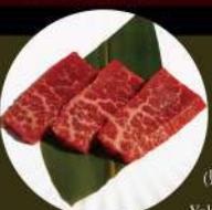
B3. 澳洲和牛三角腩 AUS Wagyu Chuck Short Rib Level 1: 2片 pcs Level 2: 2片 pcs Level 3: 3片 pcs