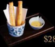
和牛芝士春卷 (半份) Cheesy Wagyu Spring Roll (Half)