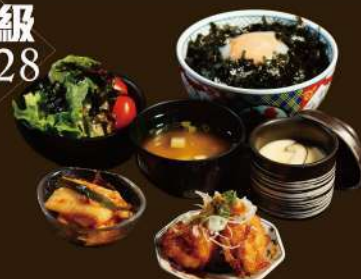
溫泉蛋韓式紫菜飯 Rice with Onsen Egg and Roasted Seaweed 增量沙律 Mini Salad (upgrade), 日式京蔥油炸雞 Deep-fried Chicken with Scallion and Minced Ginger 2pcs