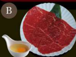
B1. Yaki-Shabu 上等牛後腿肉 (薄切) Top Gooseneck Round Yaki-Shabu Level 1: 2片 pcs Level 2: 2片 pcs Level 3: 3片 pcs