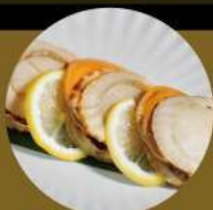
C2. 日本帆立貝肉 Cooked Japanese Scallop Level 1: 1件 pcs Level 2: 1件 pcs Level 3: 1件 pcs